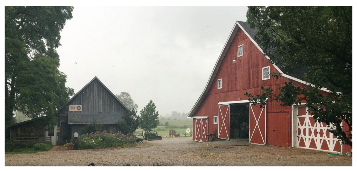
The historic buildings at Dull's Tree Farm have been lovingly preserved

Tom and Kerry Dull wrapped up the day by speaking about why they chose to invest in their barns, and how they are integral to their thriving Christmas tree and agri-tourism business. The capstone to the day was the sun that broke through the rainy day – just in time to take a tour of the barns and log cabins.