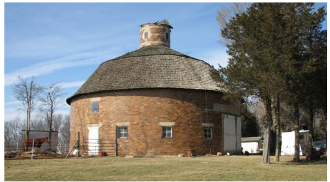
Griffin round barn, Steuben County. The only round barn in Indiana constructed of glazed tile.

The Griffin Round Barn has a 60 foot diameter with a silo of glazed tiles in the center. The cupola is actually the upper portion of the silo with the tiles arranged in a decorative pattern. The roof atop the silo had a small dormer for filling the silo, but unfortunately the silo's roof has collapsed. One of the interesting features of the barn is that some of the tiles have the manufacturer's name stamped on the tile, "Brazil Hollow Brick and Tile Co."