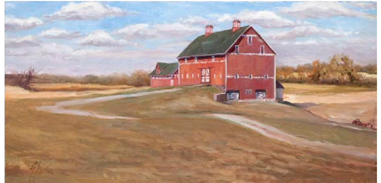
Henry County, All Hands family barn