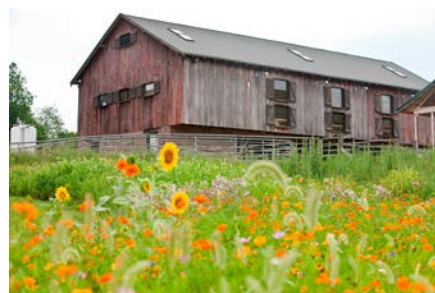
The historic Red Barn at Traders Point Creamery, part of the July 18th farm tour

Registration: $30 for members, $40 nonmembers. indianabarns.org