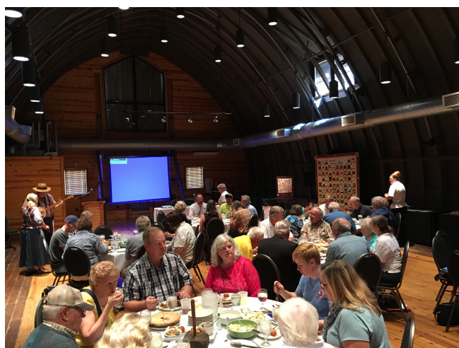
A full house enjoyed networking with other barn owners and enthusiasts at the Normandy Barn during IBF's 3rd Annual Meeting.