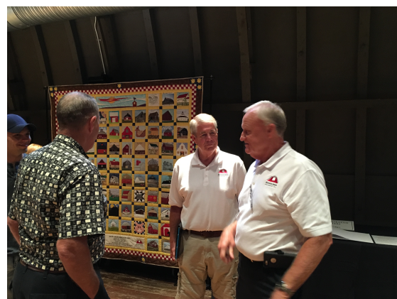
Rep. Bob Cherry (middle) shared updates on the new Heritage Barn property tax relief bill.