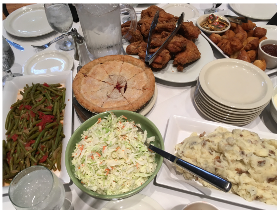
Good food and good times were had by all!