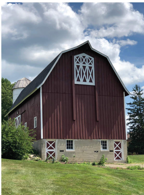
LaPorte County Farm Barn graces the skyline of the town of LaPorte

This year's tour will take you on a self-guided, driving tour with visits to five barns, as well as other