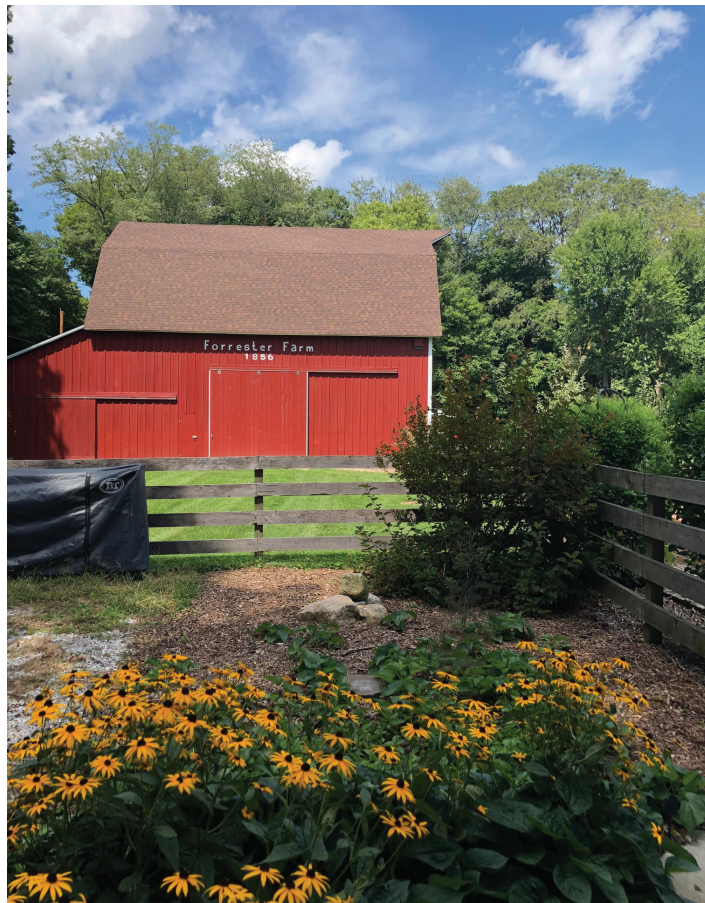
The Forrester Farm, listed on the National Register of Historic Places